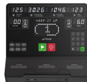
UNITE LED CONSOLE