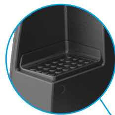
Rear steps provide user-friendly step-up assistance