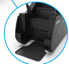
Optional Sweat Tray