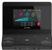
UNITE 10" TOUCHSCREEN