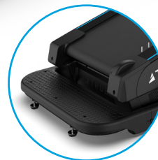
Optional rear step